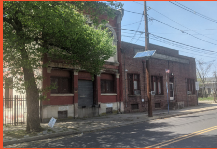
283 - 289 NORTH WILLOW STREET