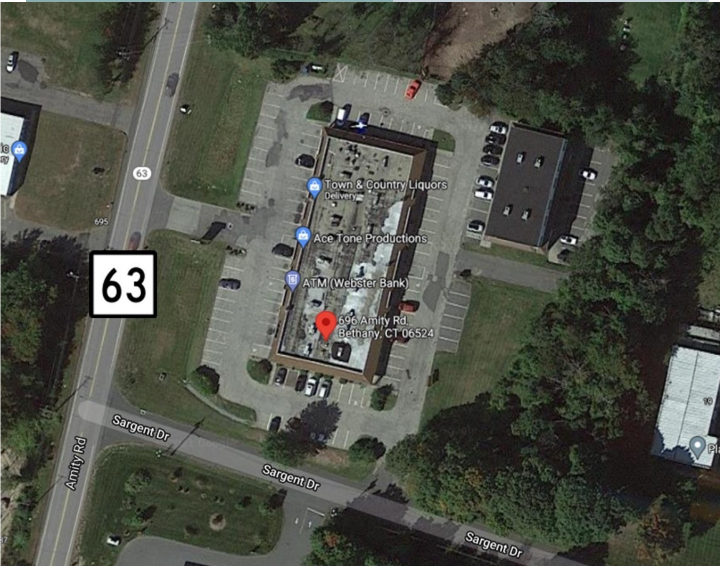
Information deemed reliable but not guaranteed and offerings subject to errors, omissions, change of price or withdrawal without notice.