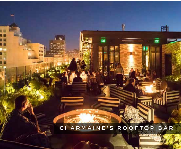
CHARMAINE'S ROOFTOP BAR