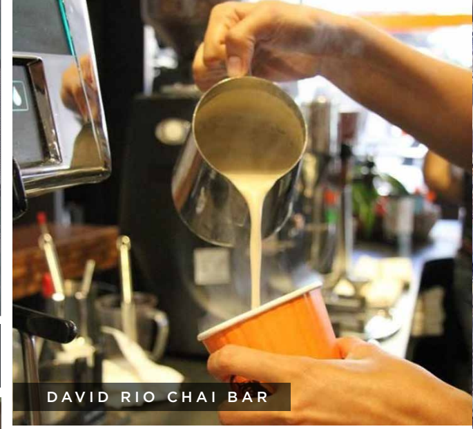
DAVID RIO CHAI BAR