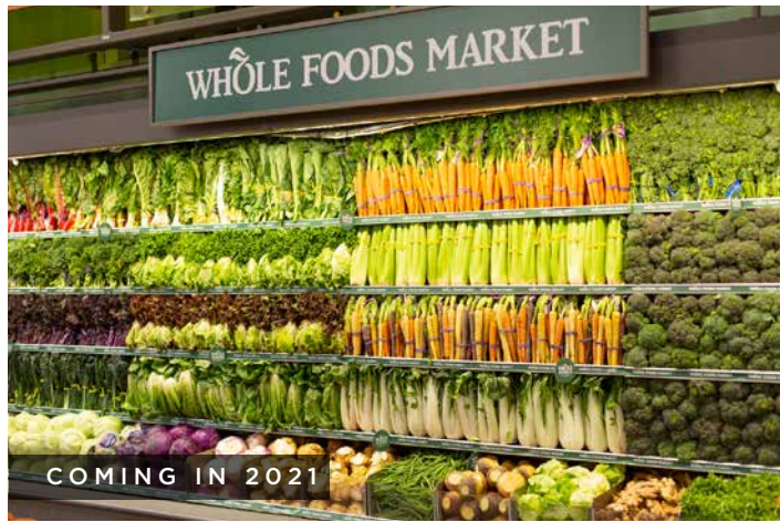
COMING IN 2021