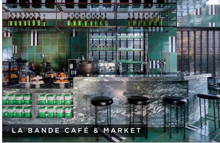
LA BANDE CAFÉ & MARKET