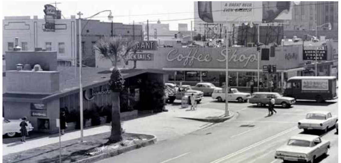
INTERSECTION OF VAN BUREN AND CENTRAL AVENUE