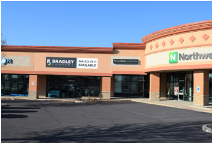
Former Fit Body Boot Camp Suite 114