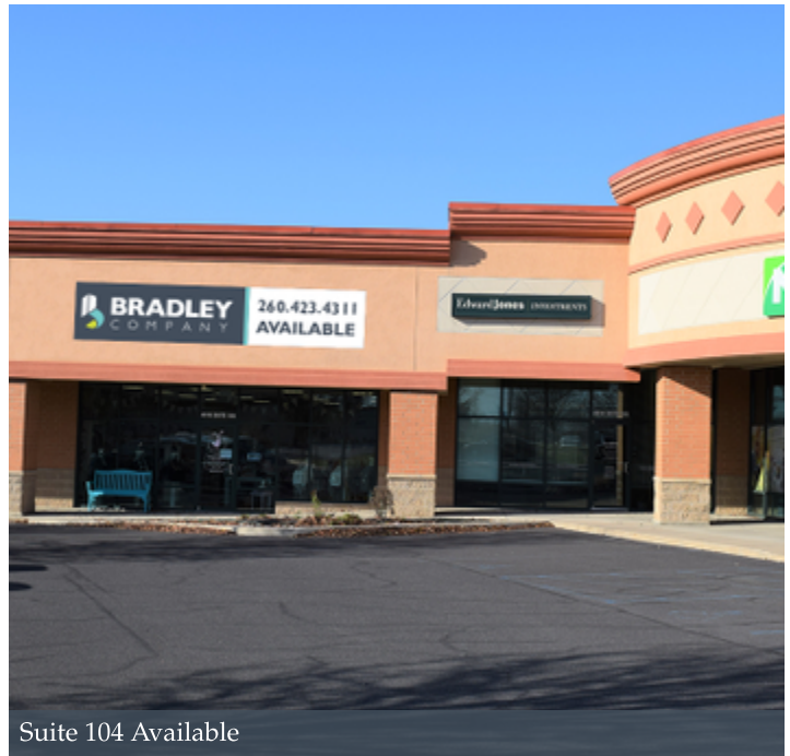
Suite 104 Available