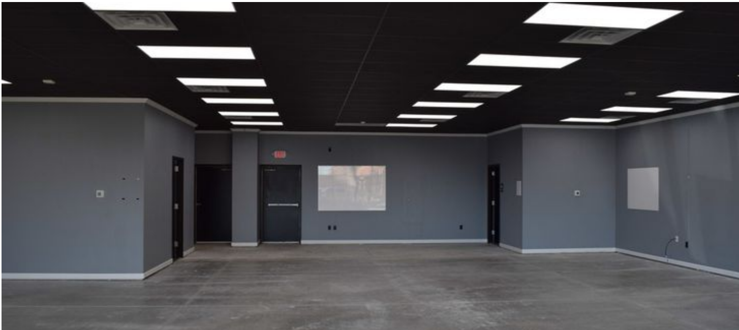
Former Fit Body Boot Camp Suite 114