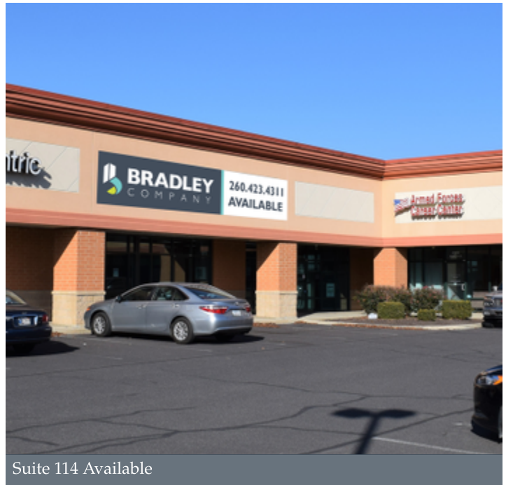
Suite 114 Available