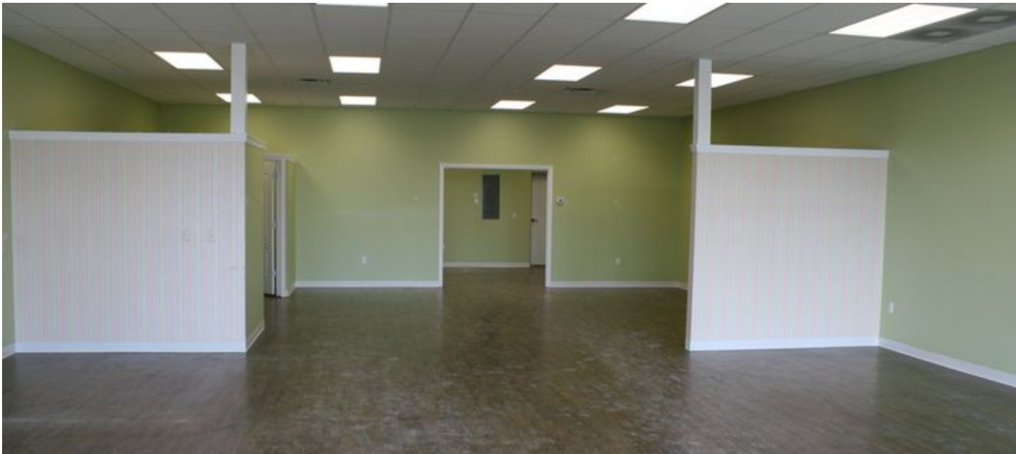
Former Baby Buyou Suite 104