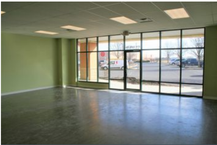
Former Baby Buyou Suite 104