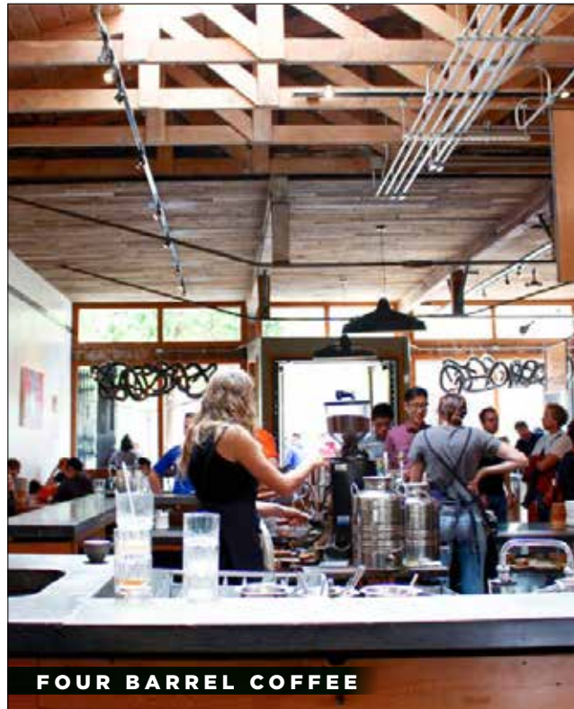
FOUR BARREL COFFEE