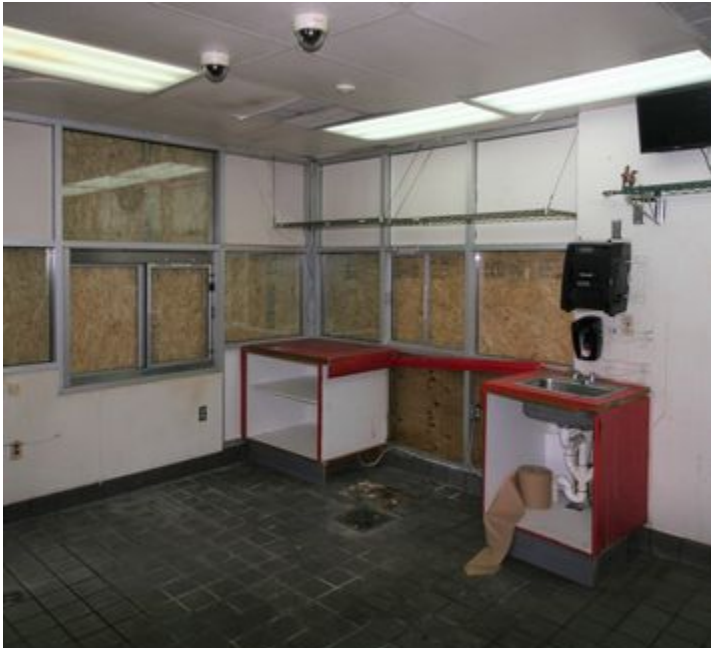
Drive thru windows