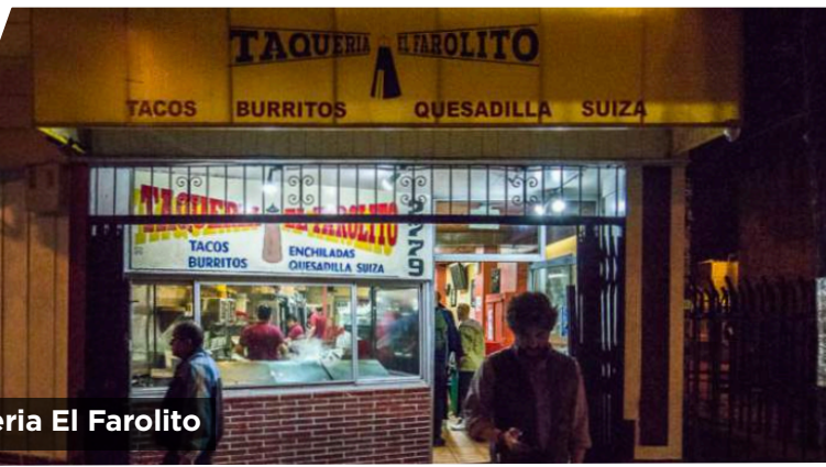
Taqueria El Farolito