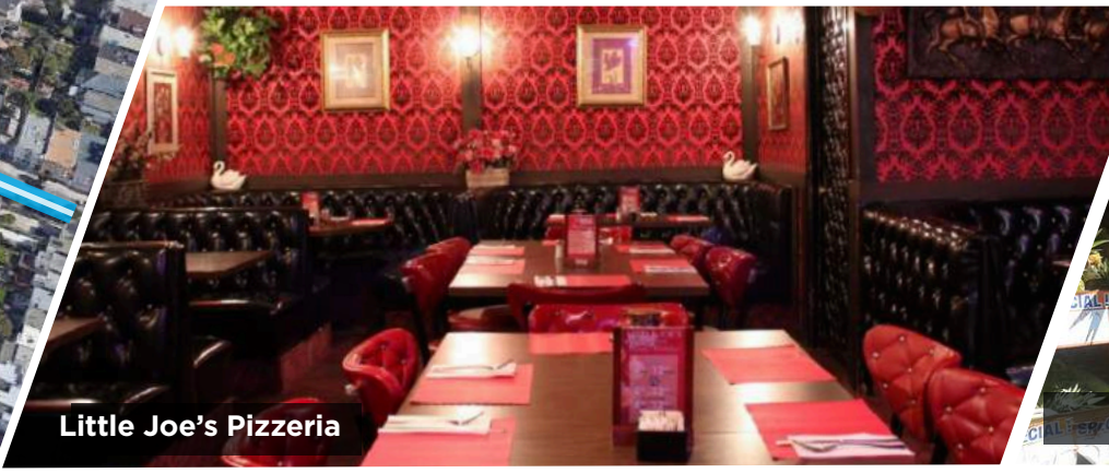
Little Joe's Pizzeria