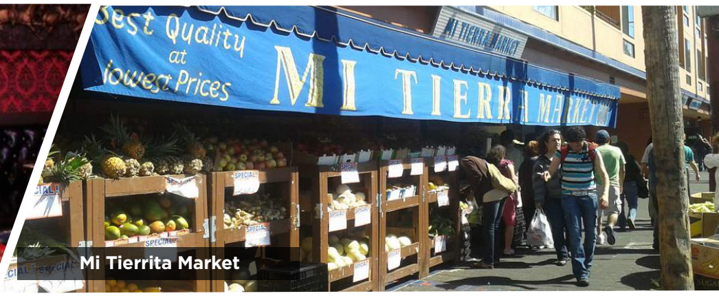
Mi Tierrita Market