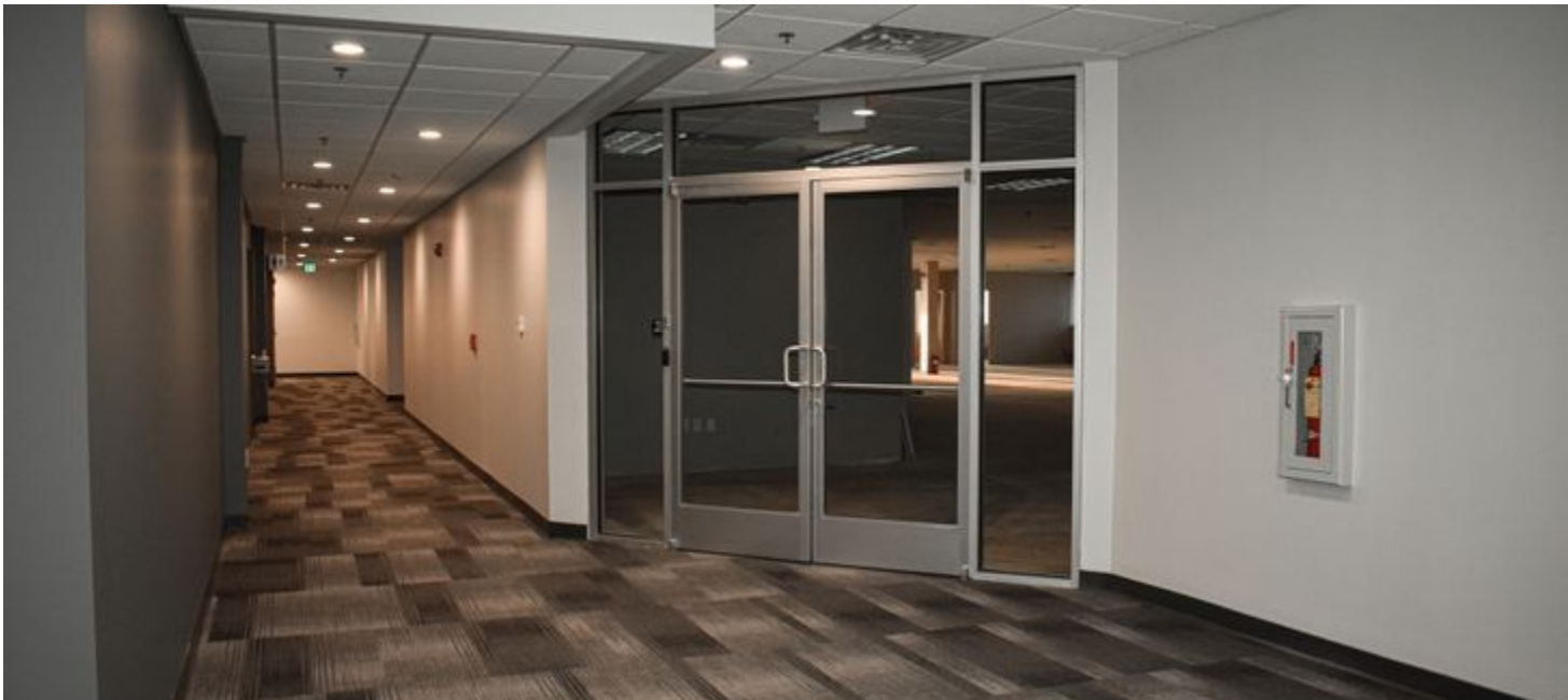
Entrance to suite 202