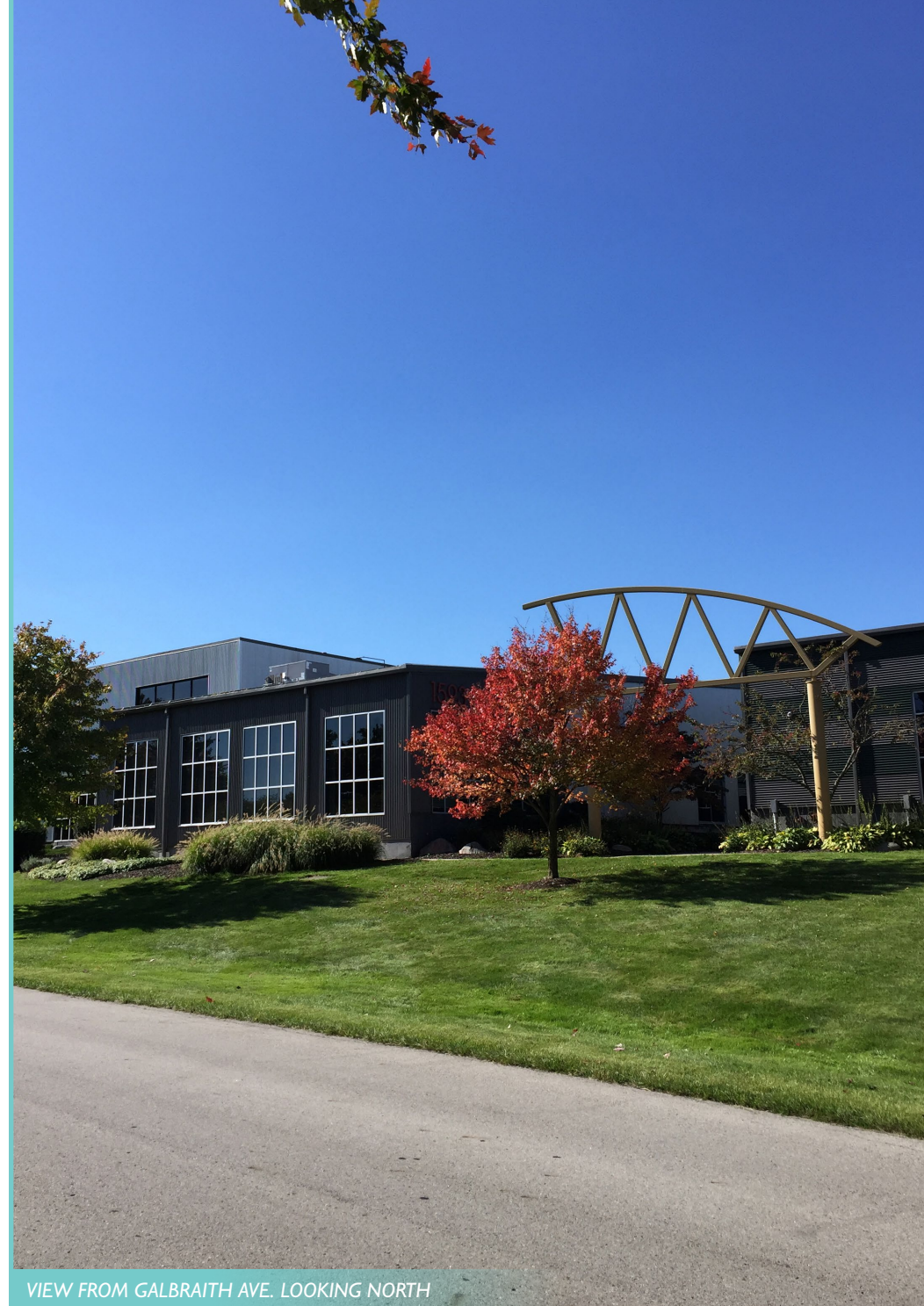
VIEW FROM GALBRAITH AVE. LOOKING NORTH

Lease Structure: Modified Gross Lease Tenant is responsible for base rent, suite janitorial, voice and data