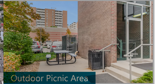
Outdoor Picnic Area