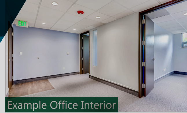
Example Office Interior