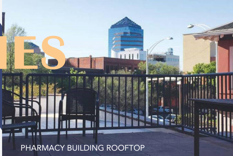
PHARMACY BUILDING ROOFTOP