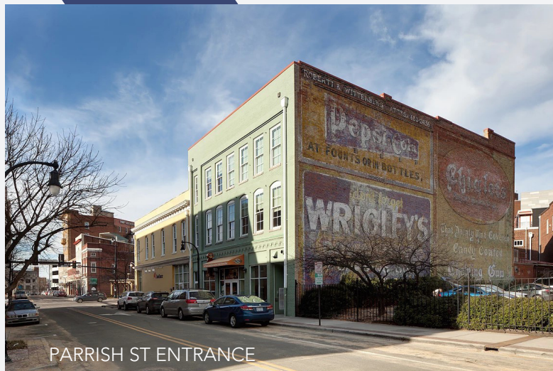
PARRISH ST ENTRANCE