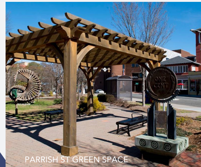
PARRISH ST GREEN SPACE