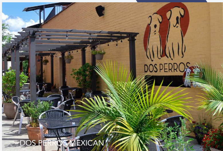
DOS PERROS MEXICAN