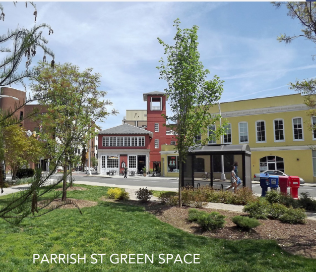
PARRISH ST GREEN SPACE