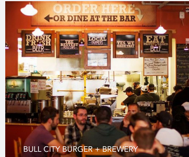
BULL CITY BURGER + BREWERY