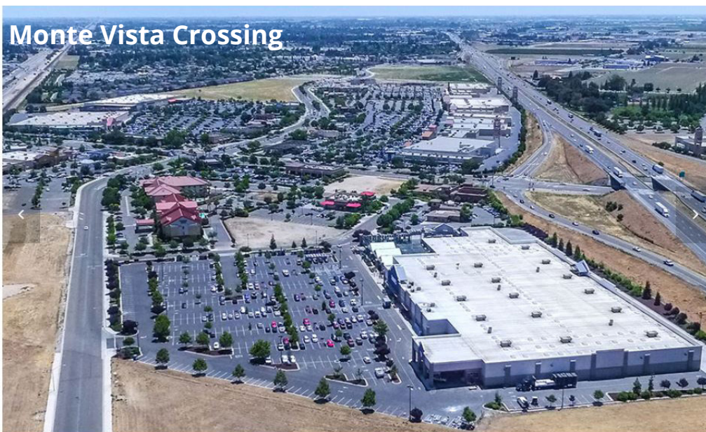
Monte Vista Crossing