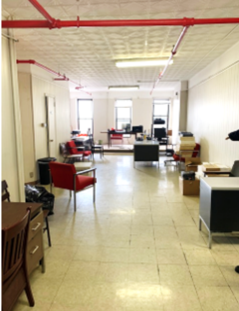
Example Meeting Room (North Facing)