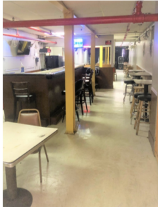
Usable Cellar Space

B6 REAL ESTATE ADVISORS 1040 Avenue of the Americas 8th Floor New York, NY 10018