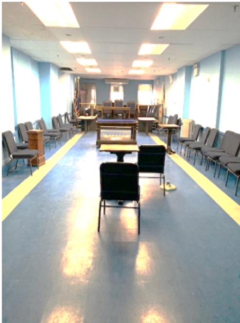
Example Event/Meeting Space (North Facing)