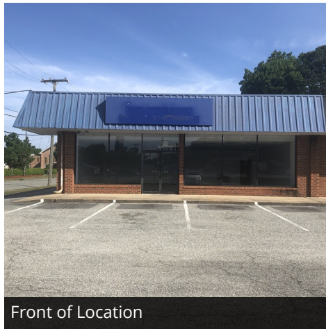
Front of Location