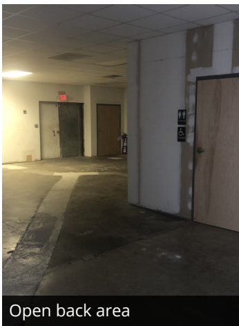
Open back area