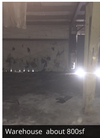
Warehouse about 800sf