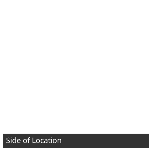
Side of Location