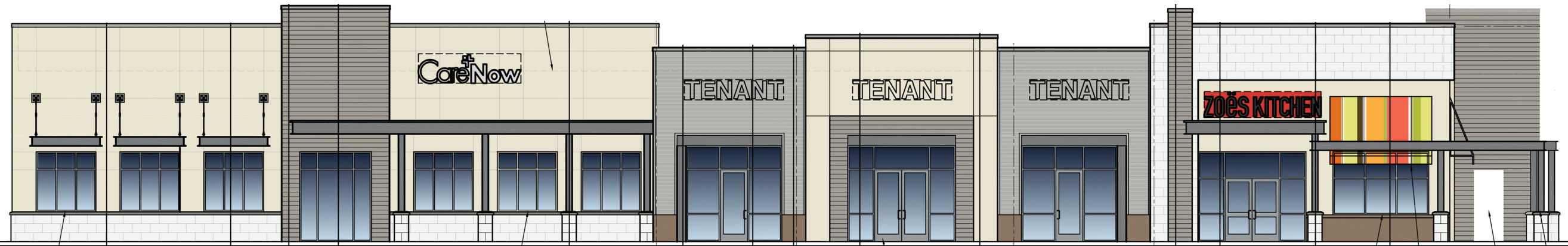
1 SOUTH ELEVATION SCALE: 1/8" = 1'-0"