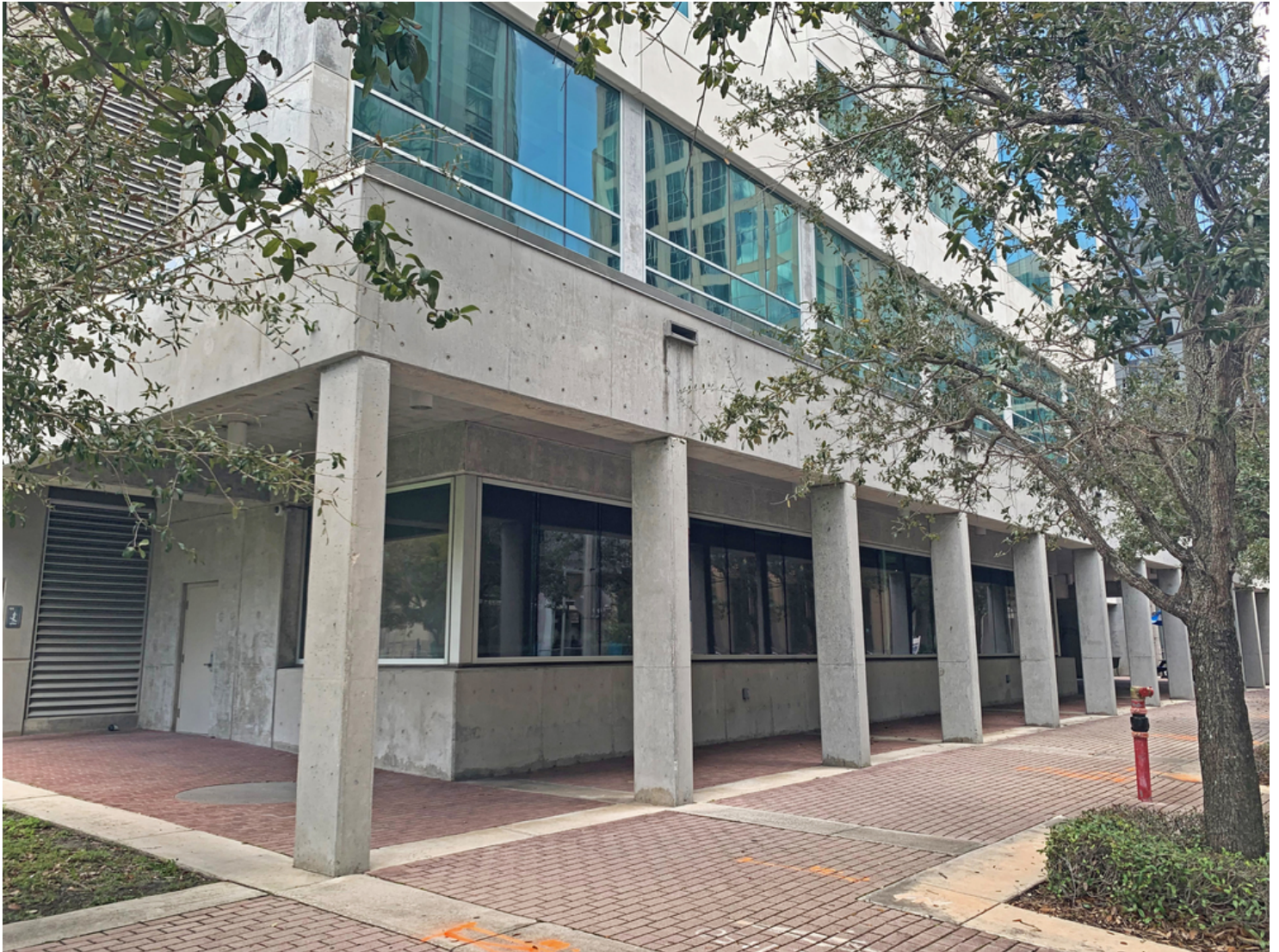
Ground floor space with frontage on E Las Olas Blvd