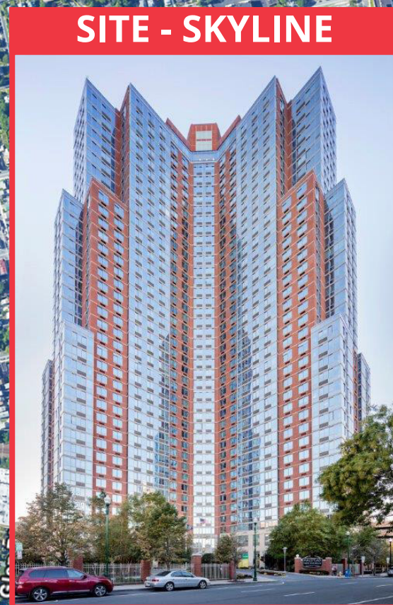
SITE - SKYLINE

Metro-North Railroad By 2021, New Rochelle will be the only rail station providing MTA service to the East/West sides of Manhattan 30 minutes to Grand Central w/ MTA service to Penn Station (Coming Soon)