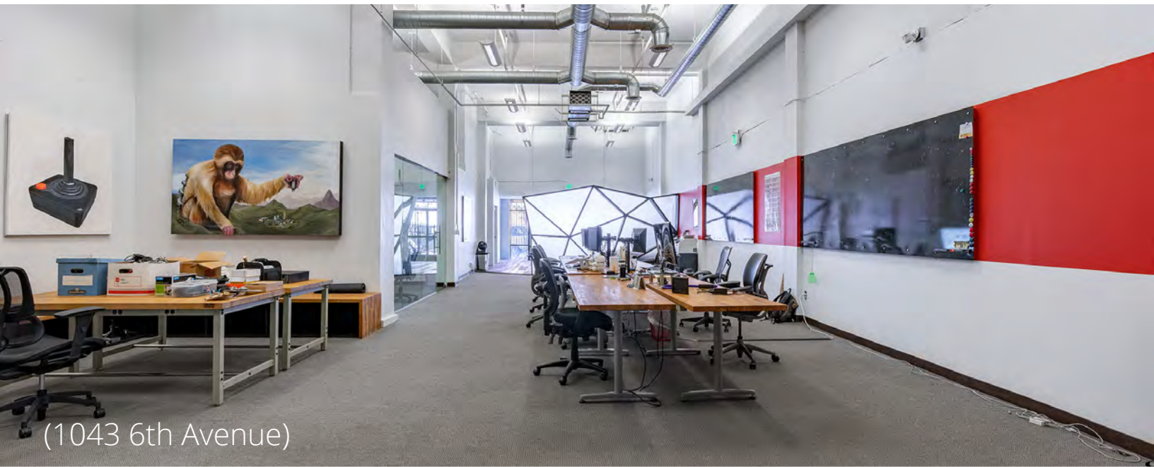
(1043 6th Avenue)