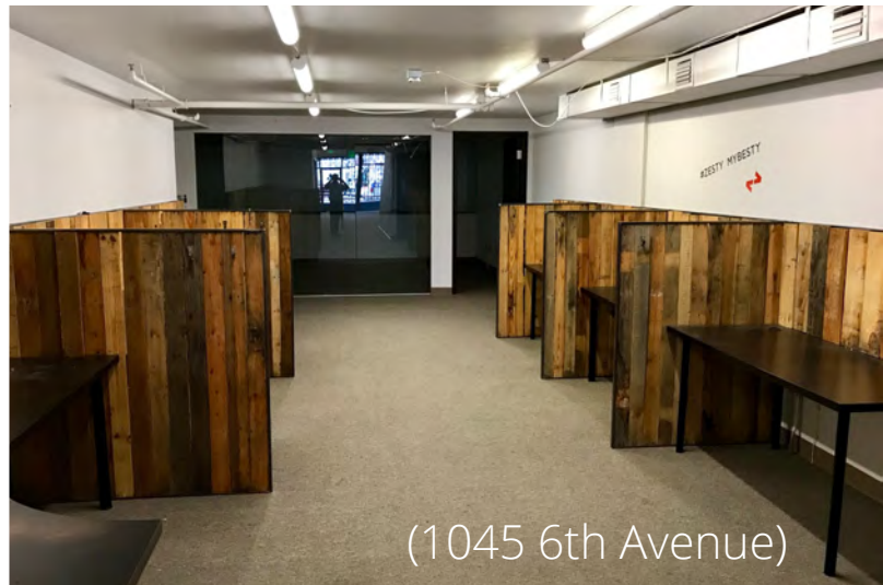
(1045 6th Avenue)