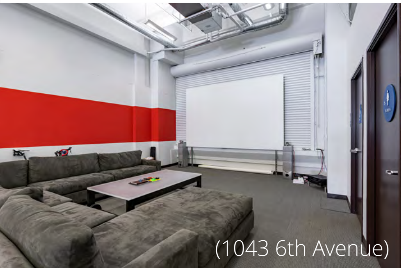
(1043 6th Avenue)