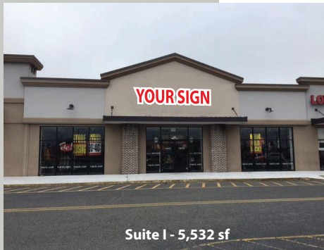
Suite I - 5,532 sf