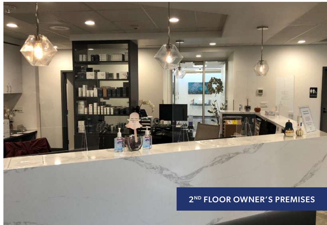
2 ND FLOOR OWNER'S PREMISES