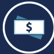
Avg. Household Income