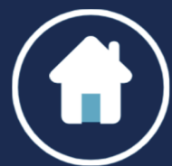
Number of Households