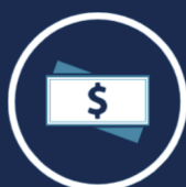
Avg. Household Income