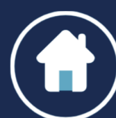
Number of Households