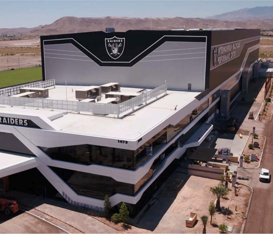
Las Vegas Raiders Practice Facility