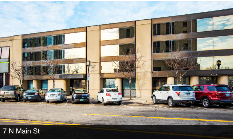
7 N Main St