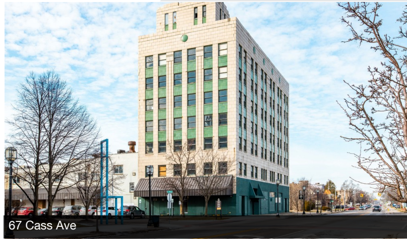
67 Cass Ave