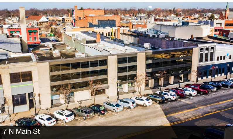
7 N Main St