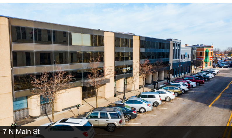
7 N Main St