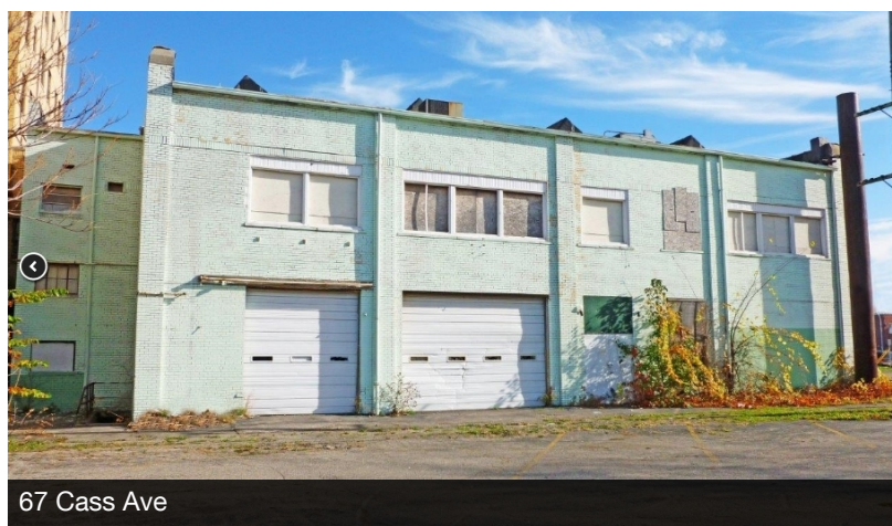
67 Cass Ave