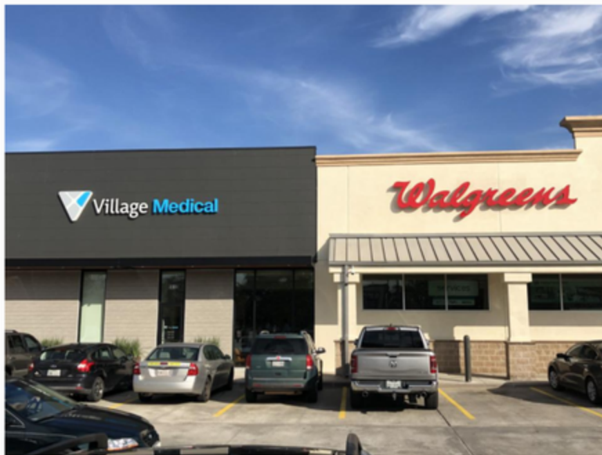
Walgreens Boots Alliance will invest $1 billion in VillageMD to open '500 to 700' physician-staffed...