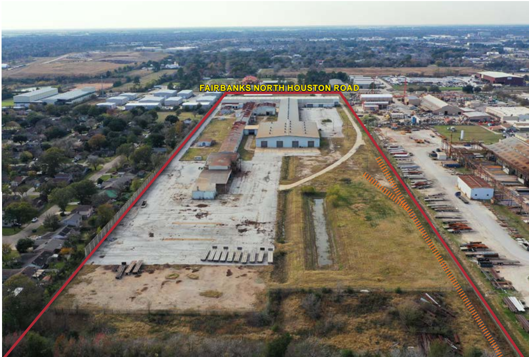
Property Aerial Looking West