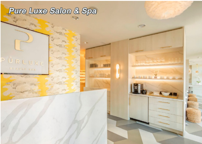
Pure Luxe Salon & Spa