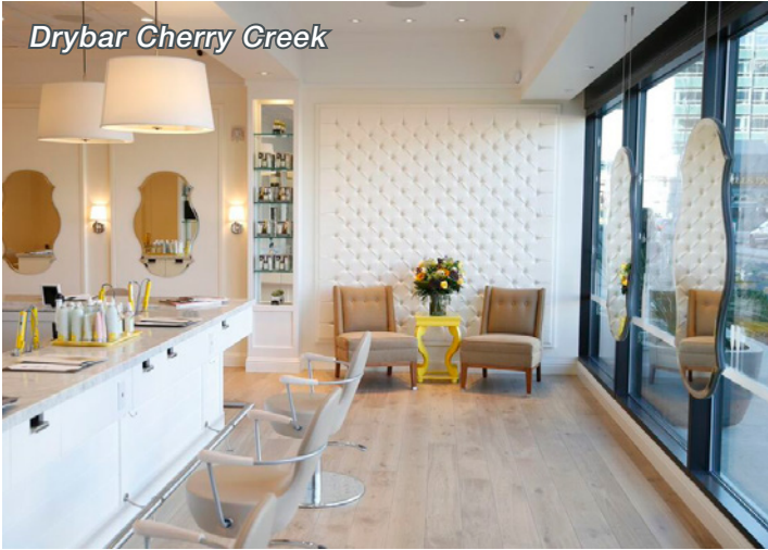
Drybar Cherry Creek