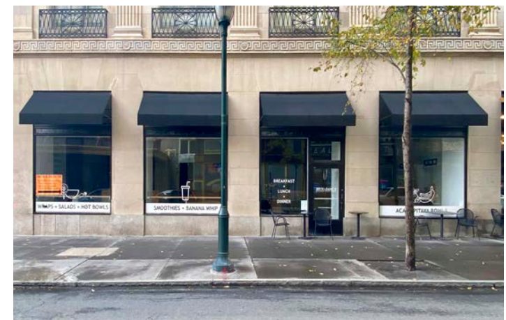
800 block of Chestnut | Retail D ▲

The information contained herein has been obtained from sources deemed reliable. MSC cannot verify it and makes no guarantee, warranty or representation about its accuracy. Any projections, opinions, assumptions or estimates provided by MSC are for discussion purposes only and do not represent the current or future performance of a property, location or market.