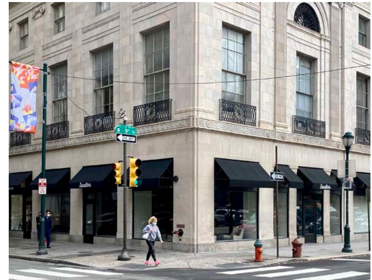
Corner of 9th and Chestnut | Retail A-C ▲