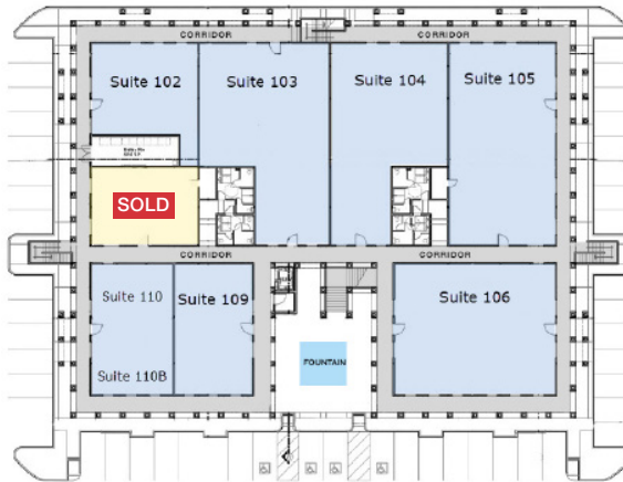
72-650 Fred Waring Drive - Ground Floor Plan