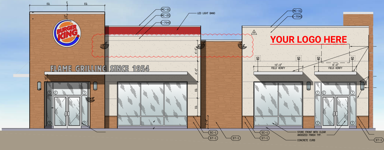
PARKING LOT/WEST ELEVATION