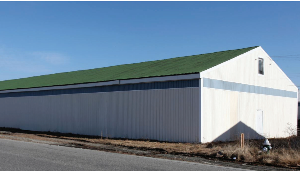
808 Warehouse Street