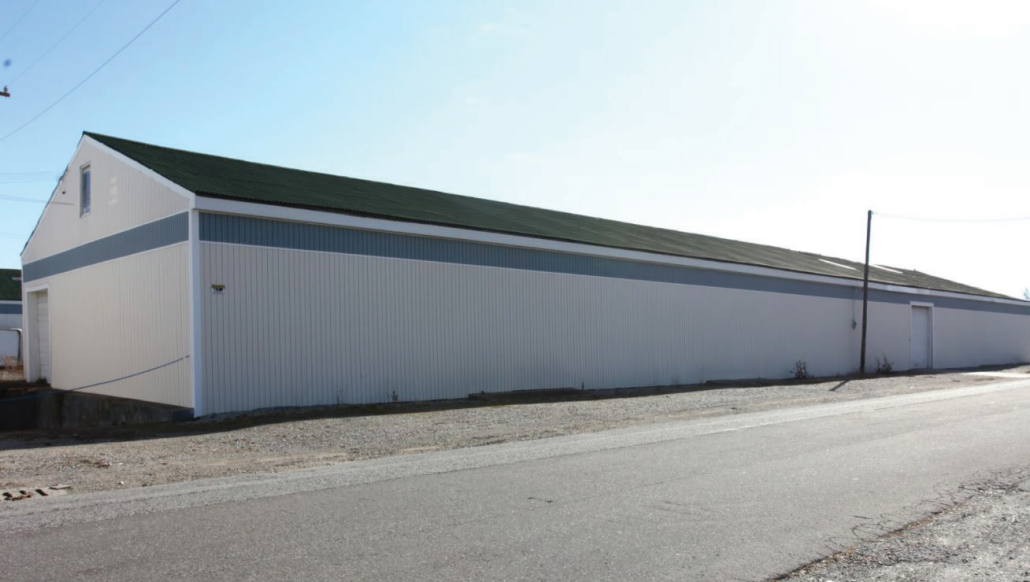
804 Warehouse Street