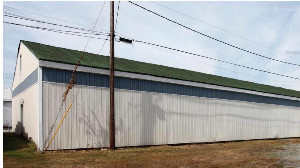
827 Goldsboro Street