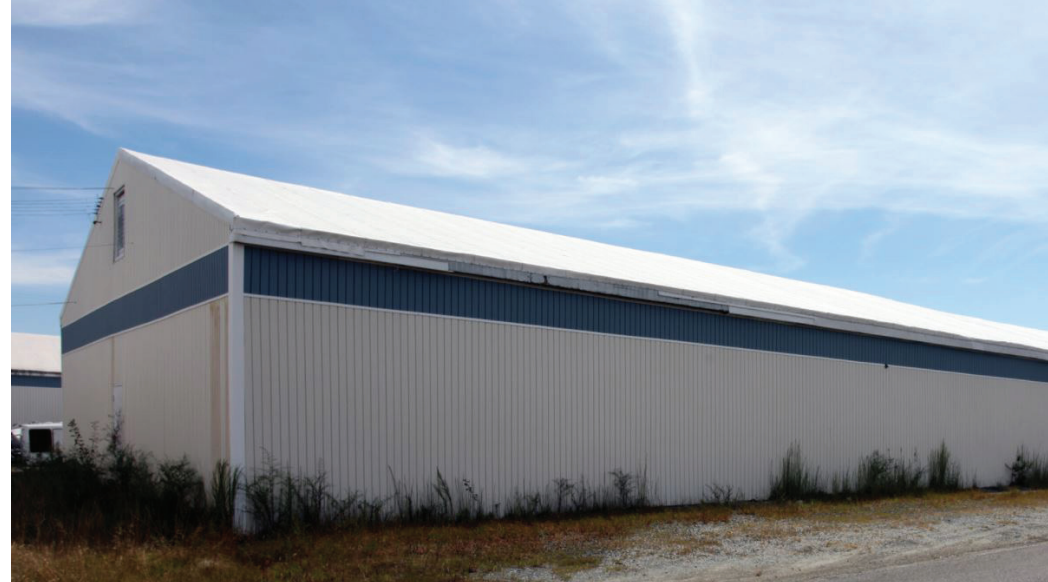
806 Warehouse Street