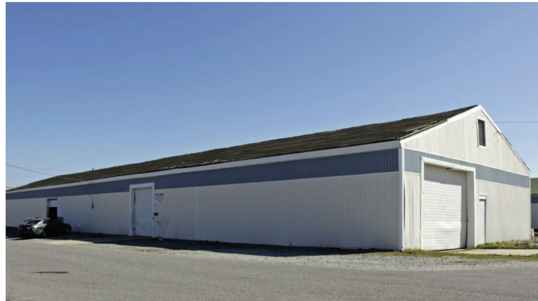
810 Warehouse Street