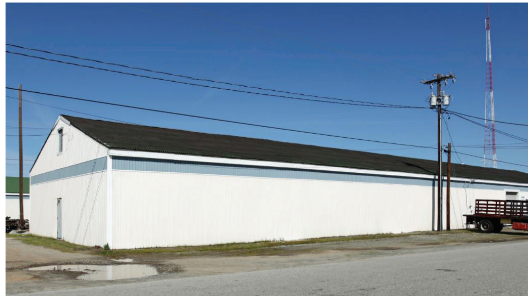
835 Goldsboro Street