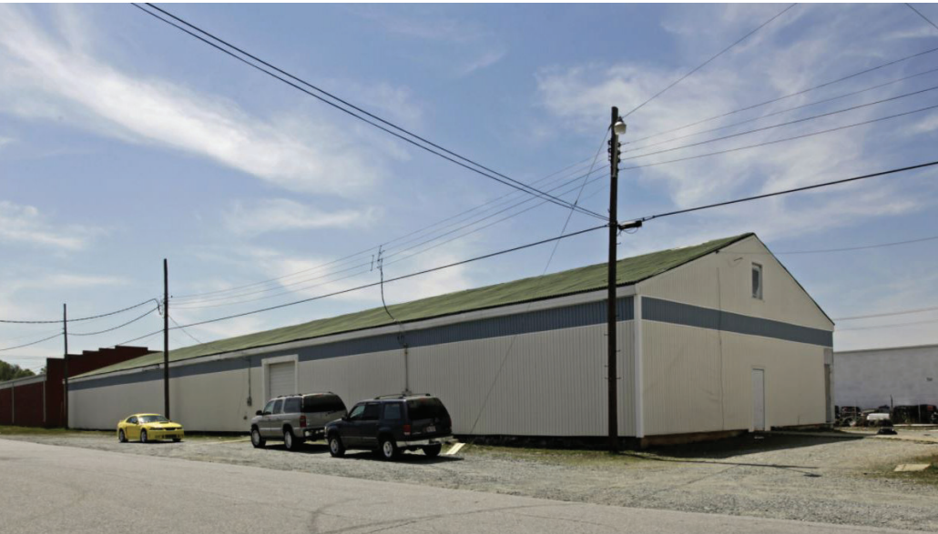
825 Goldsboro Street