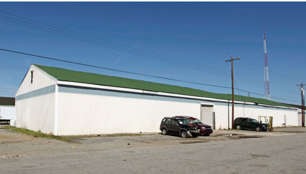
829 Goldsboro Street (Demolished - 0.57 Acre Lot)