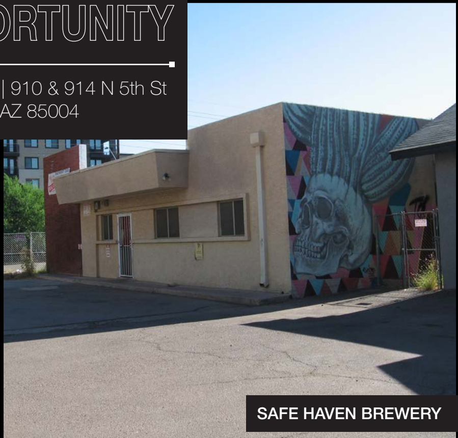
SAFE HAVEN BREWERY