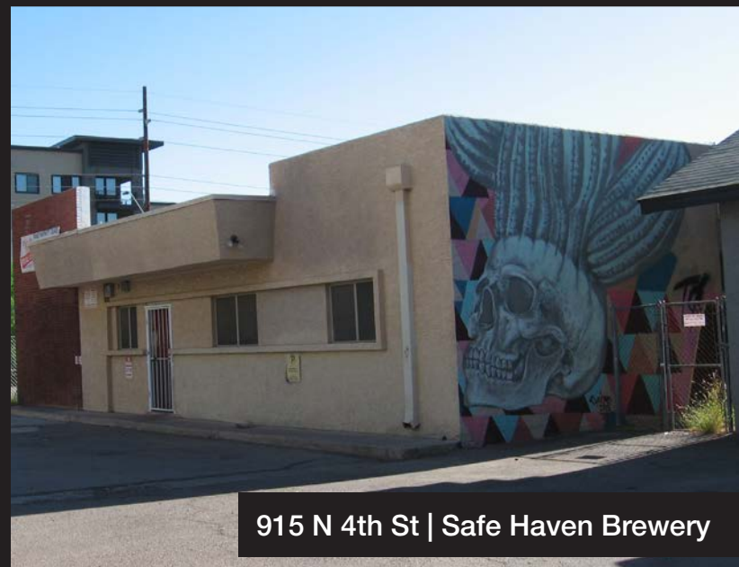
915 N 4th St | Safe Haven Brewery