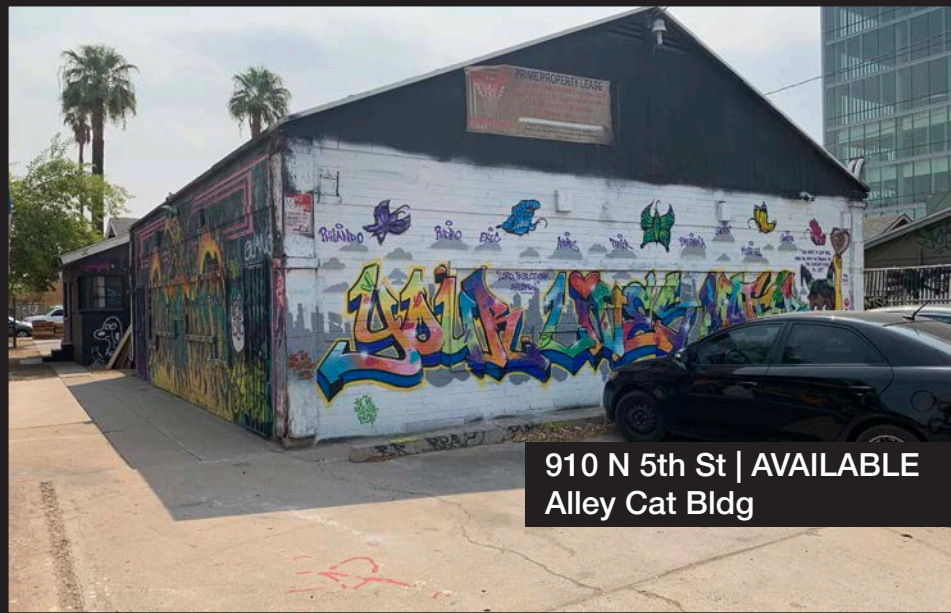
910 N 5th St | AVAILABLE Alley Cat Bldg