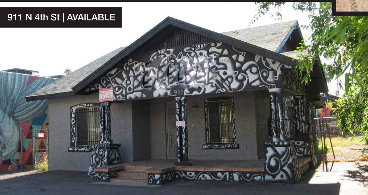
911 N 4th St | AVAILABLE