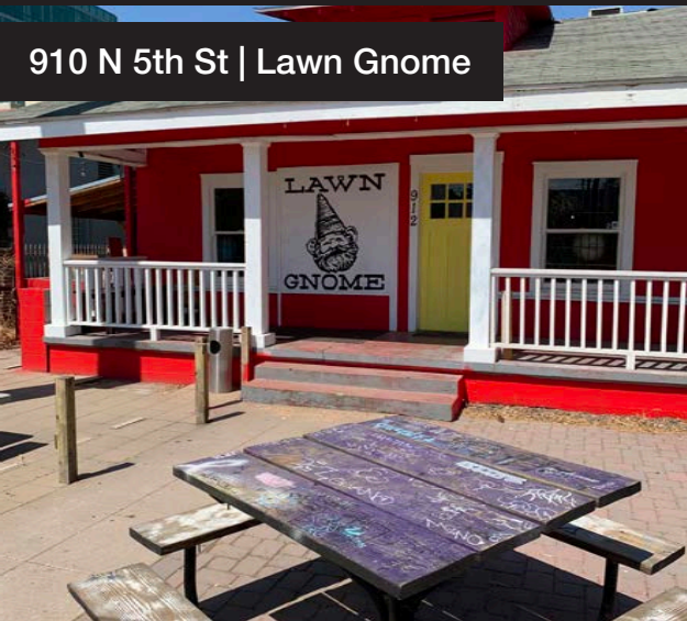
910 N 5th St | Lawn Gnome