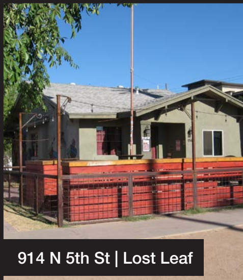
914 N 5th St | Lost Leaf