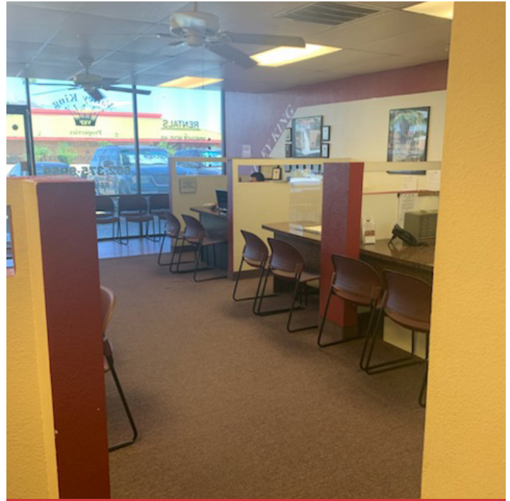
Great shopping synergy