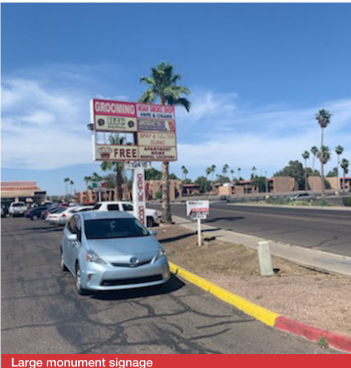
Large monument signage