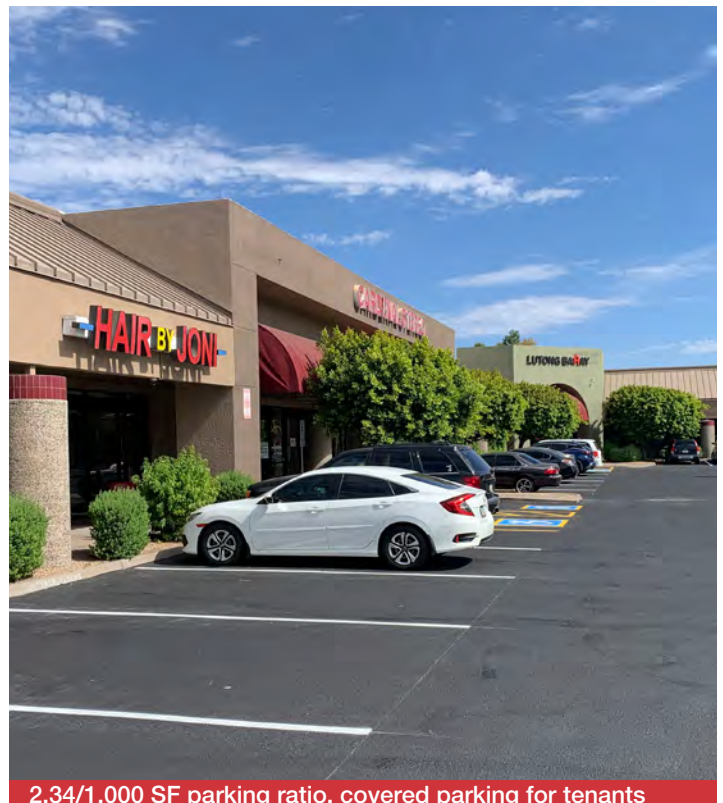
2.34/1,000 SF parking ratio, covered parking for tenants