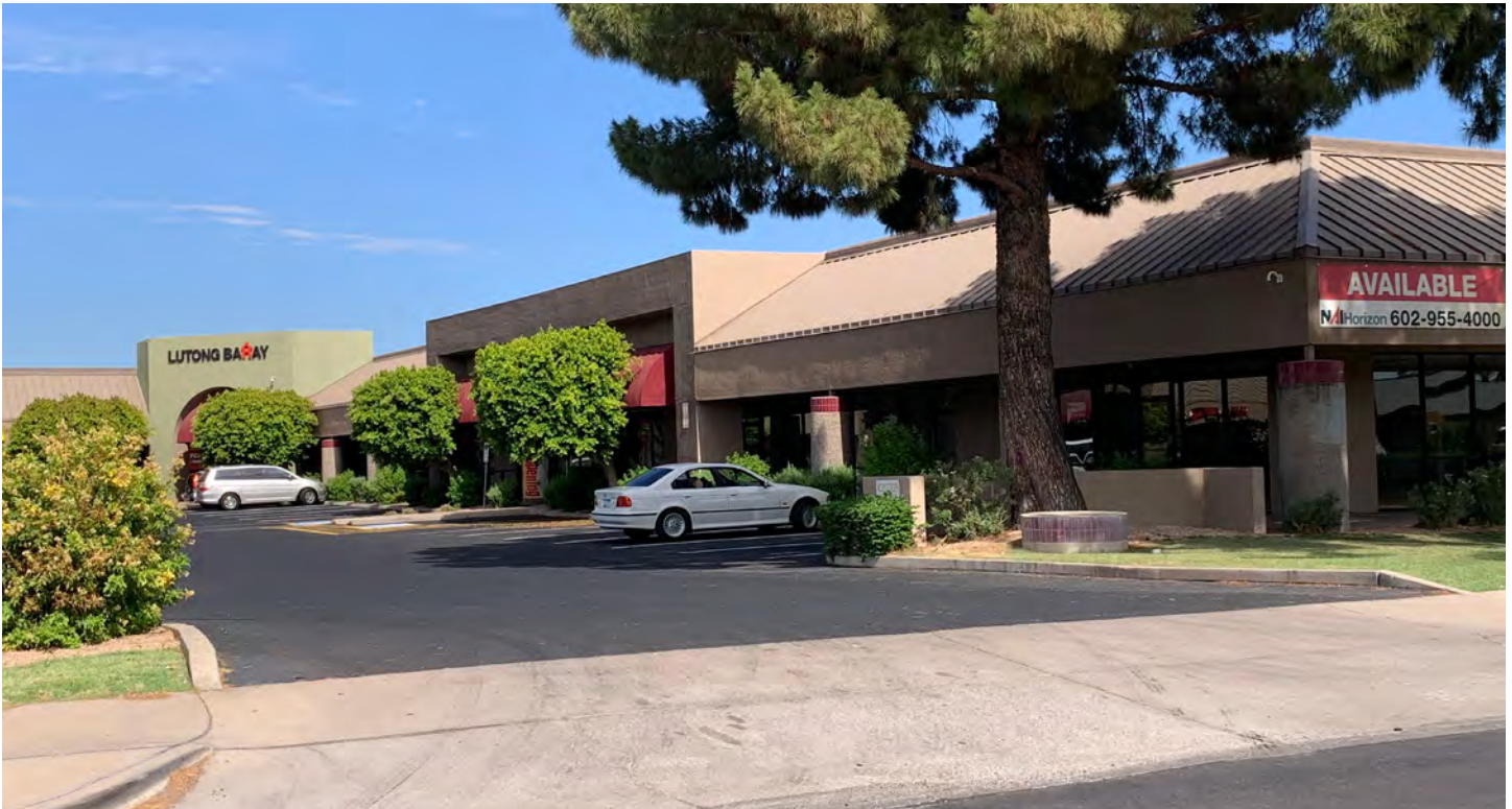
Well maintained center

For Lease Olive Crossing 1,040 - 4,450 SF