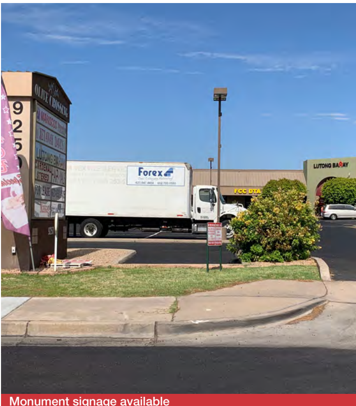
Monument signage available