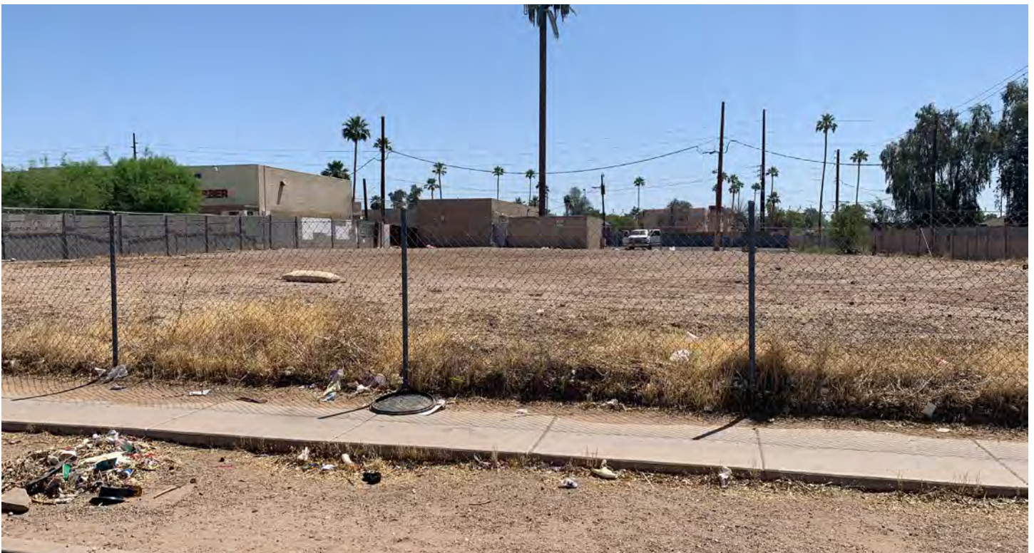
Densely populated trade area