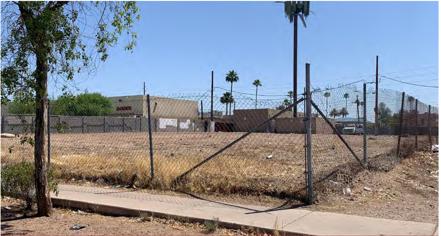
Great lease opportunity for contractor storage yard

For Sale/Lease SEC 48th Lane & Thomas Road