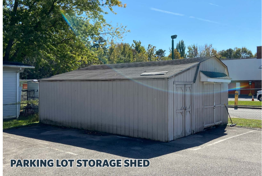
PARKING LOT STORAGE SHED