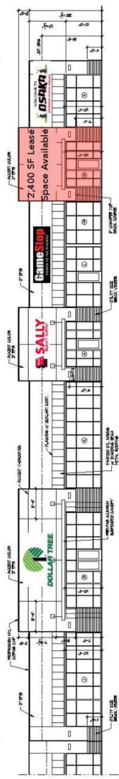
FLOOR PLAN & FRONT ELEVATION - B