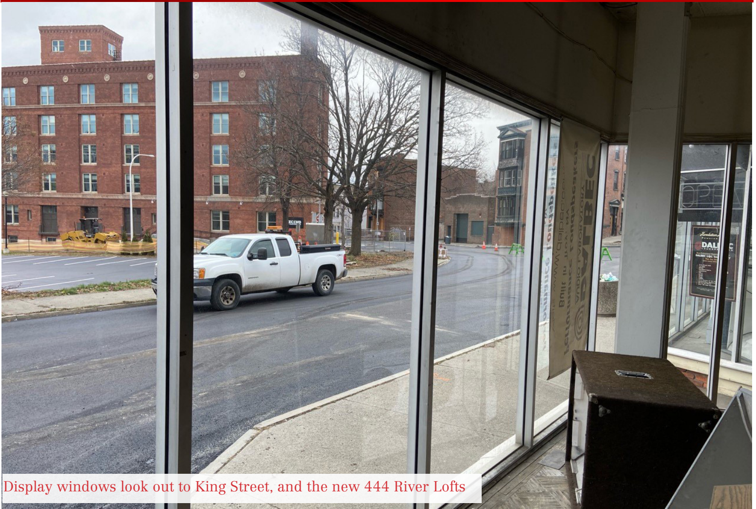
Display windows look out to King Street, and the new 444 River Lofts