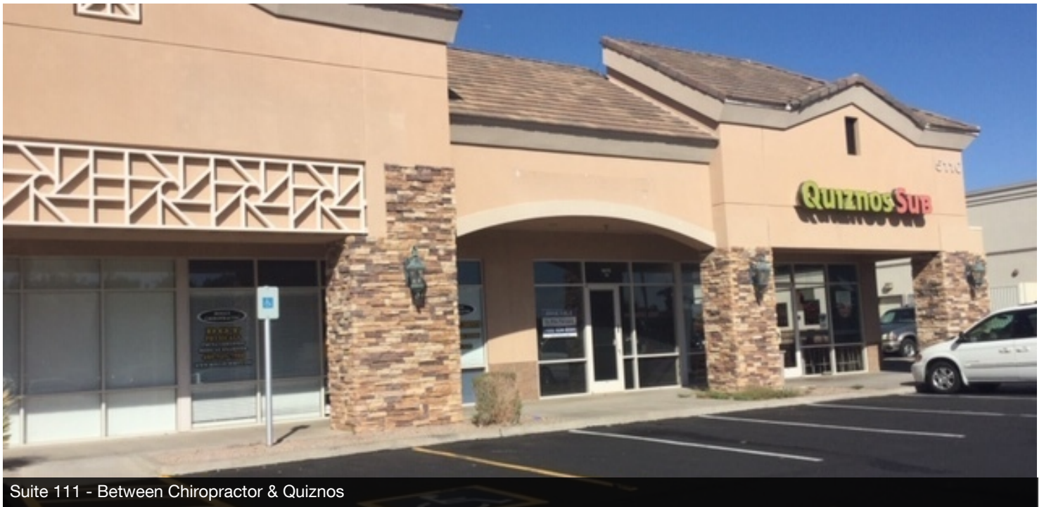
Suite 111 - Between Chiropractor & Quiznos