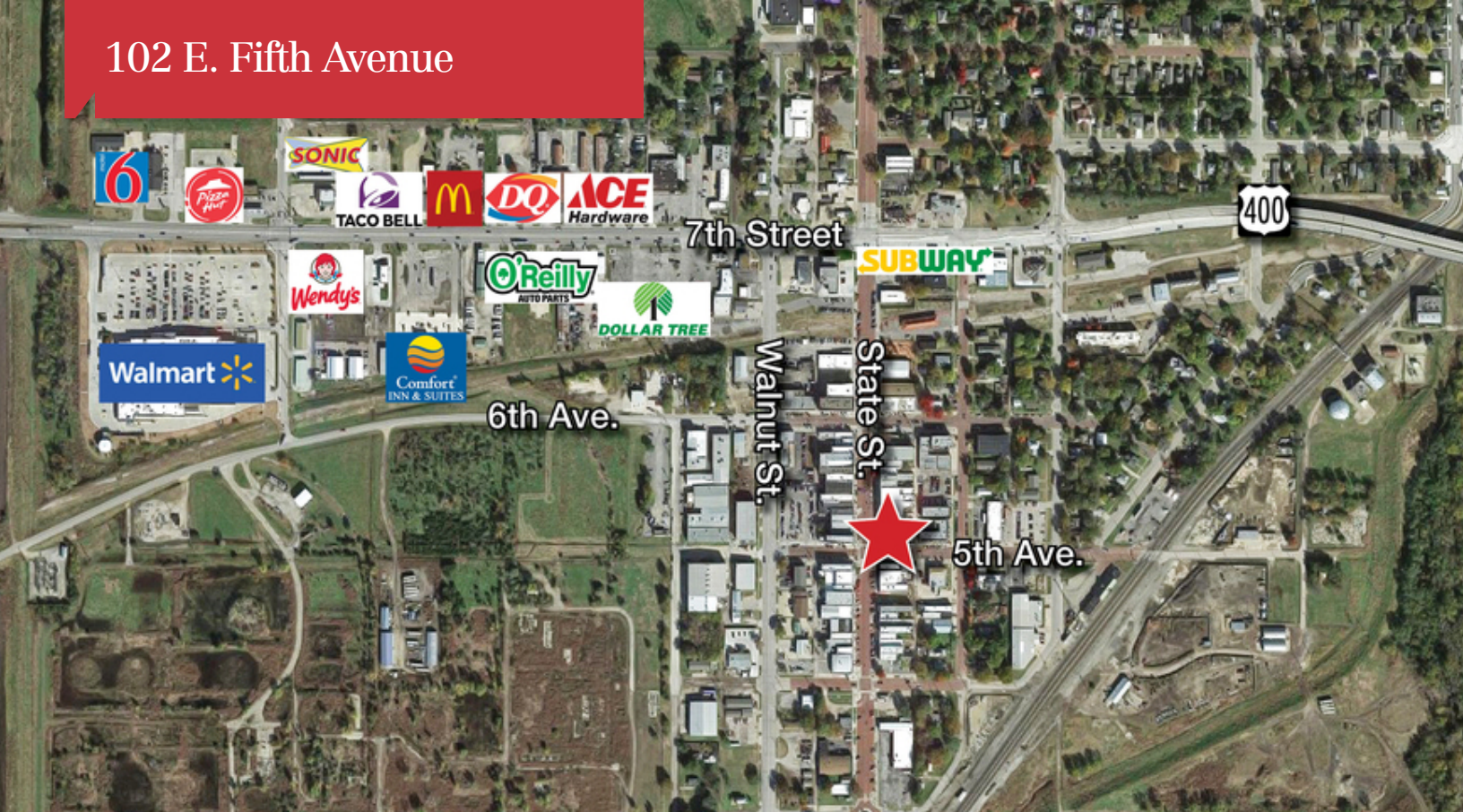
Located in Downtown Augusta, KS