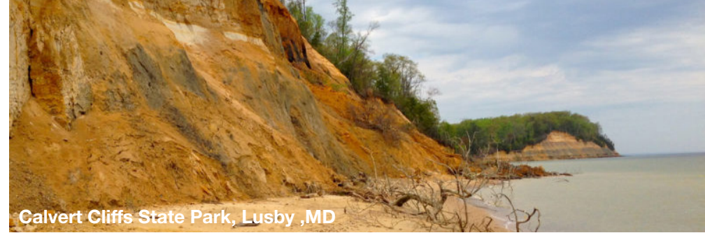
Calvert Cliffs State Park, Lusby, MD

https://dnr.maryland.gov/publiclands/pages/southern/calvertcliffs.aspx