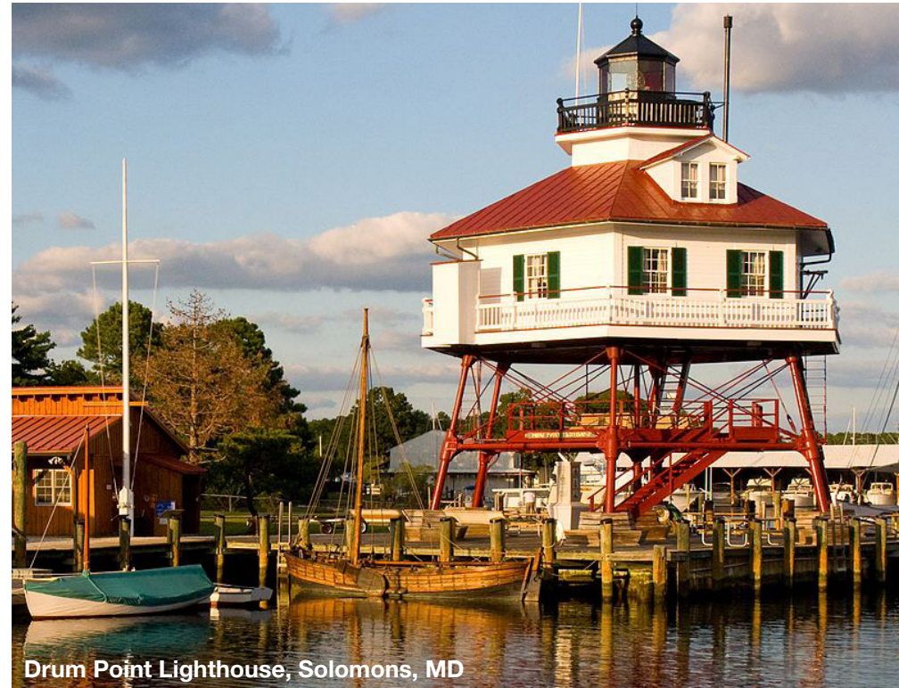
Drum Point Lighthouse, Solomons, MD