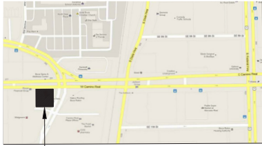
VICINITY MAP SOLID, INTS

CODE ANALYSIS: FLORIDA BUILDING CODE 2010 EDITION OCCUPANCY CLASSIFICATION: (B) BUSINESS CONSTRUCTION TYPE: (V) PROTECTED