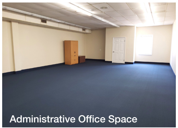
Administrative Office Space