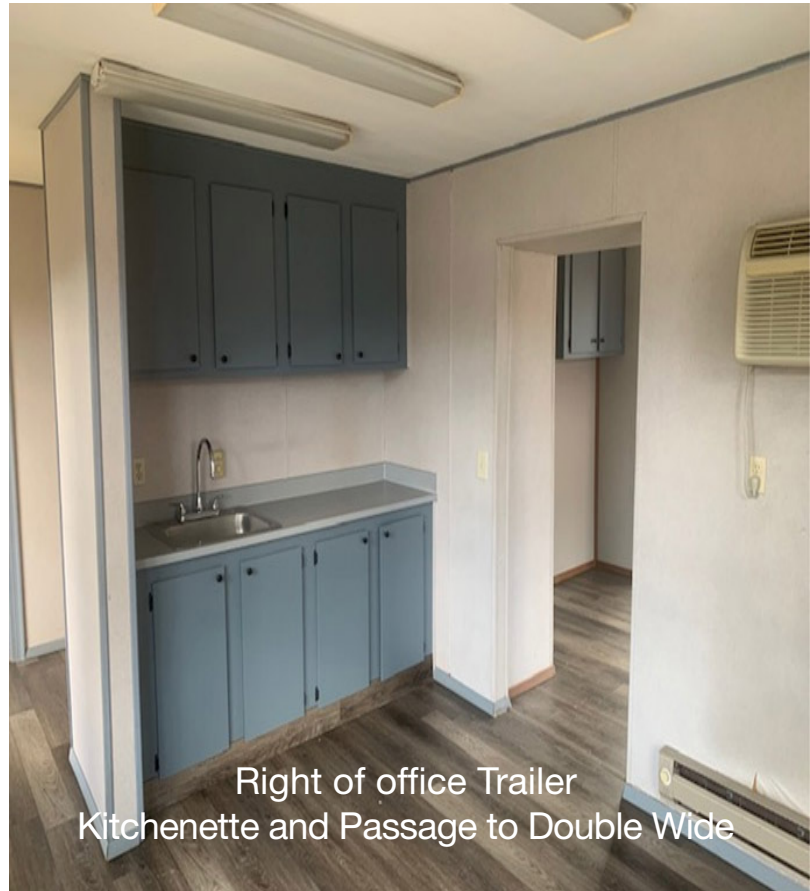
Right of office Trailer Kitchenette and Passage to Double Wide