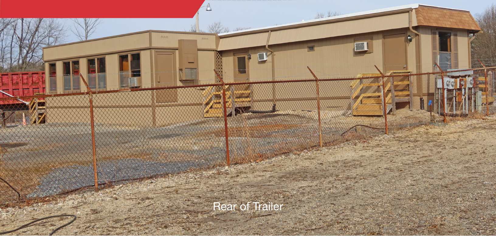
Rear of Trailer