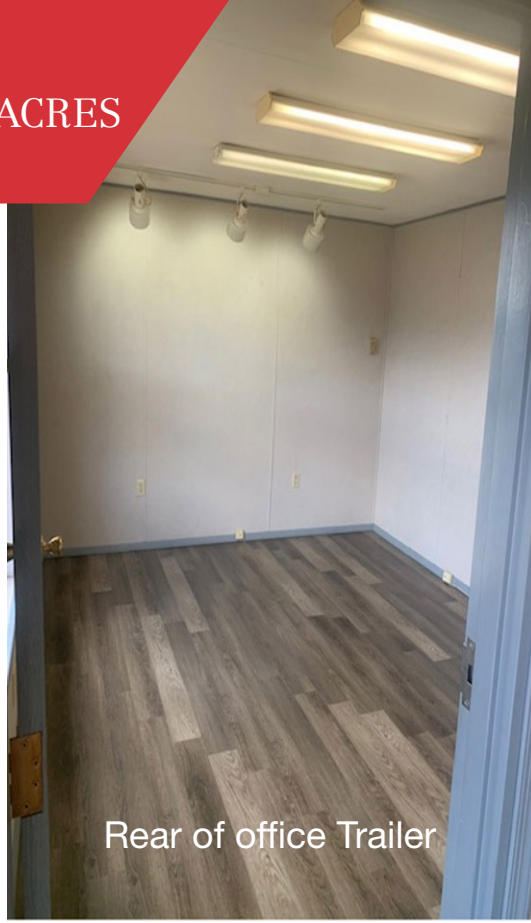
Rear of office Trailer