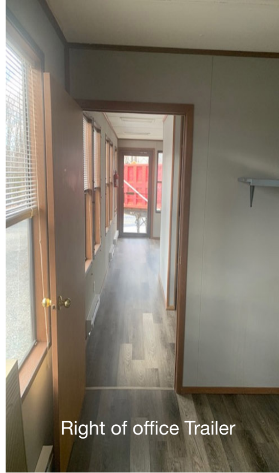
Right of office Trailer