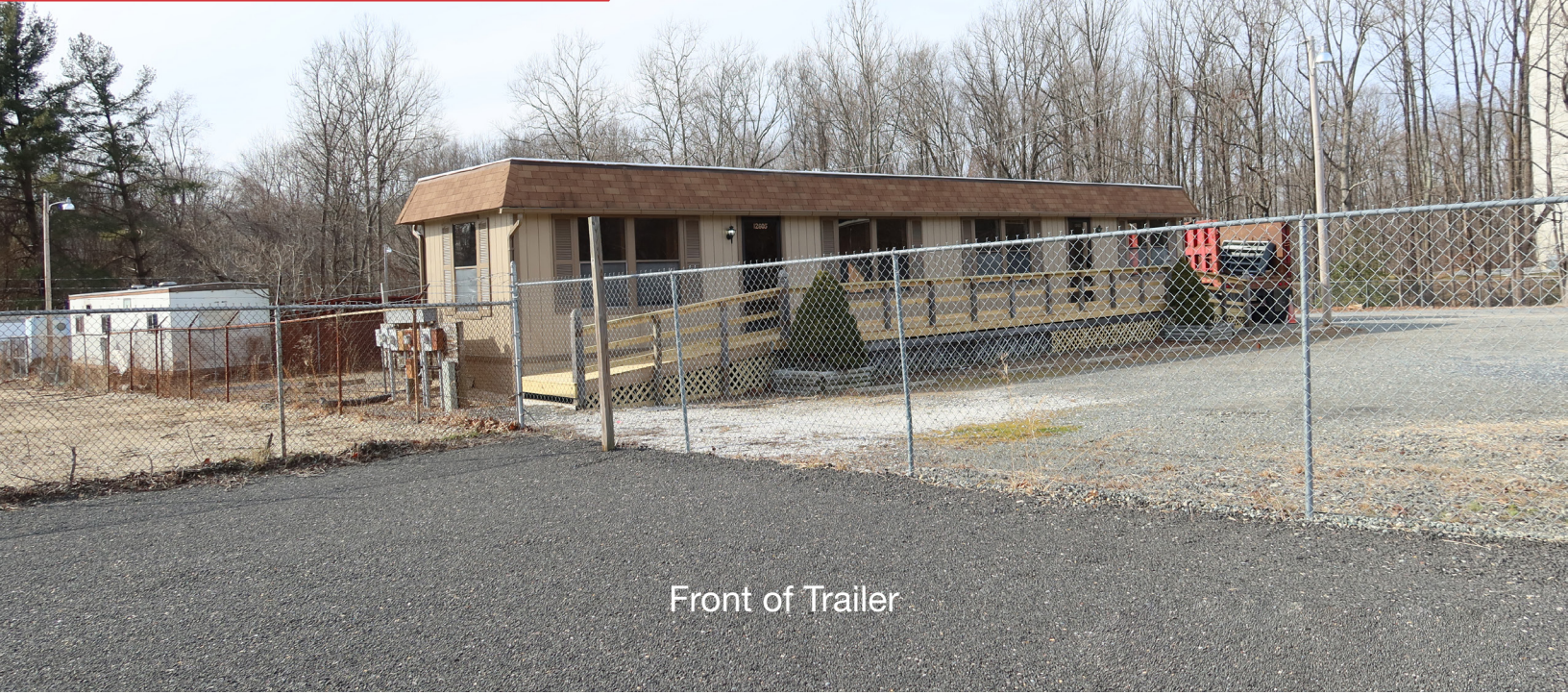
Front of Trailer