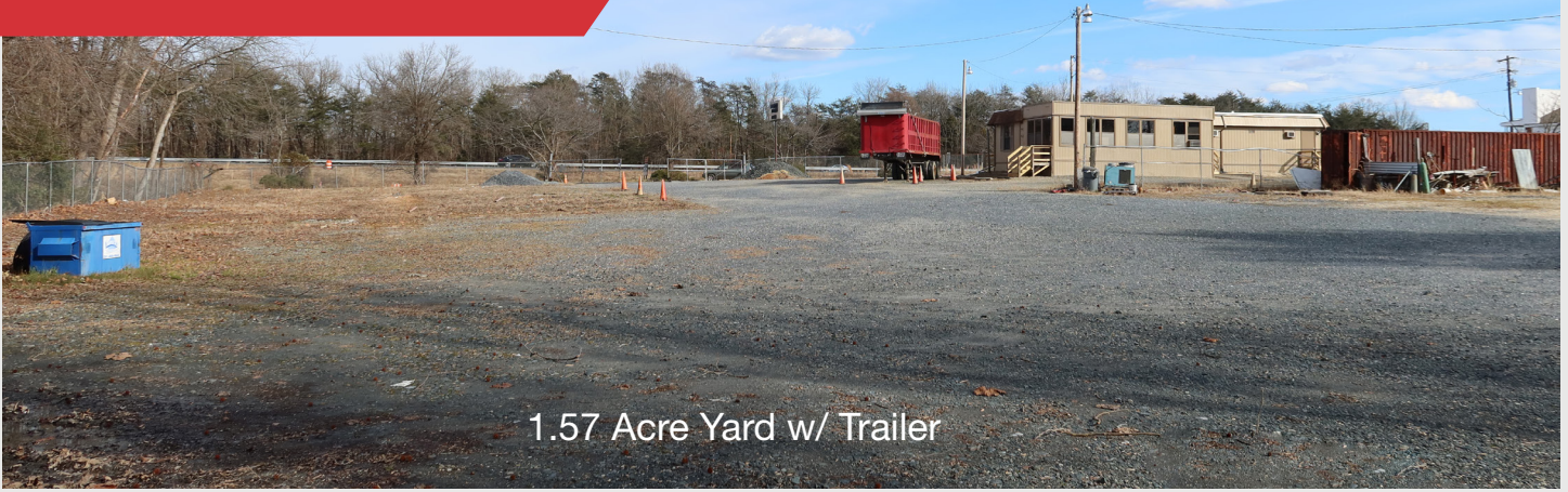
1.57 Acre Yard w/ Trailer