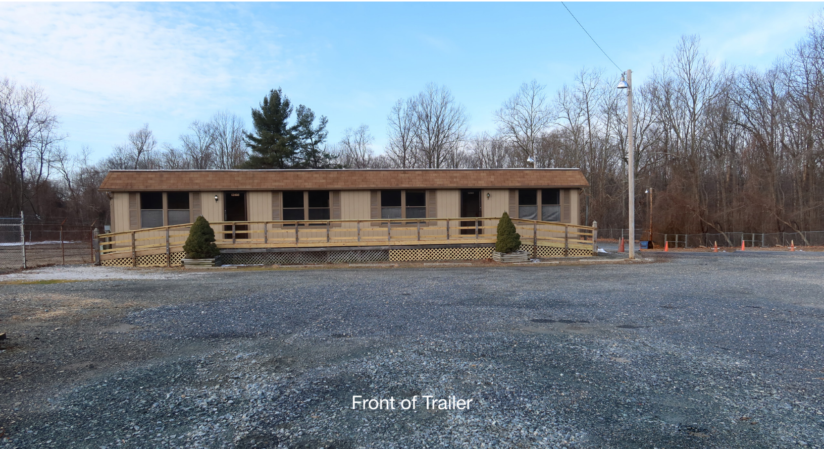
Front of Trailer