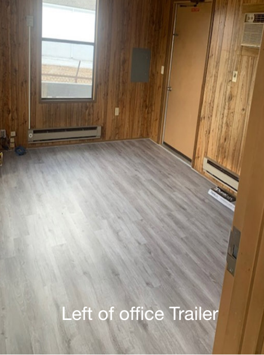
Left of office Trailer