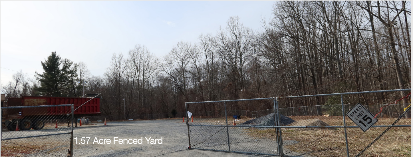
1.57 Acre Fenced Yard