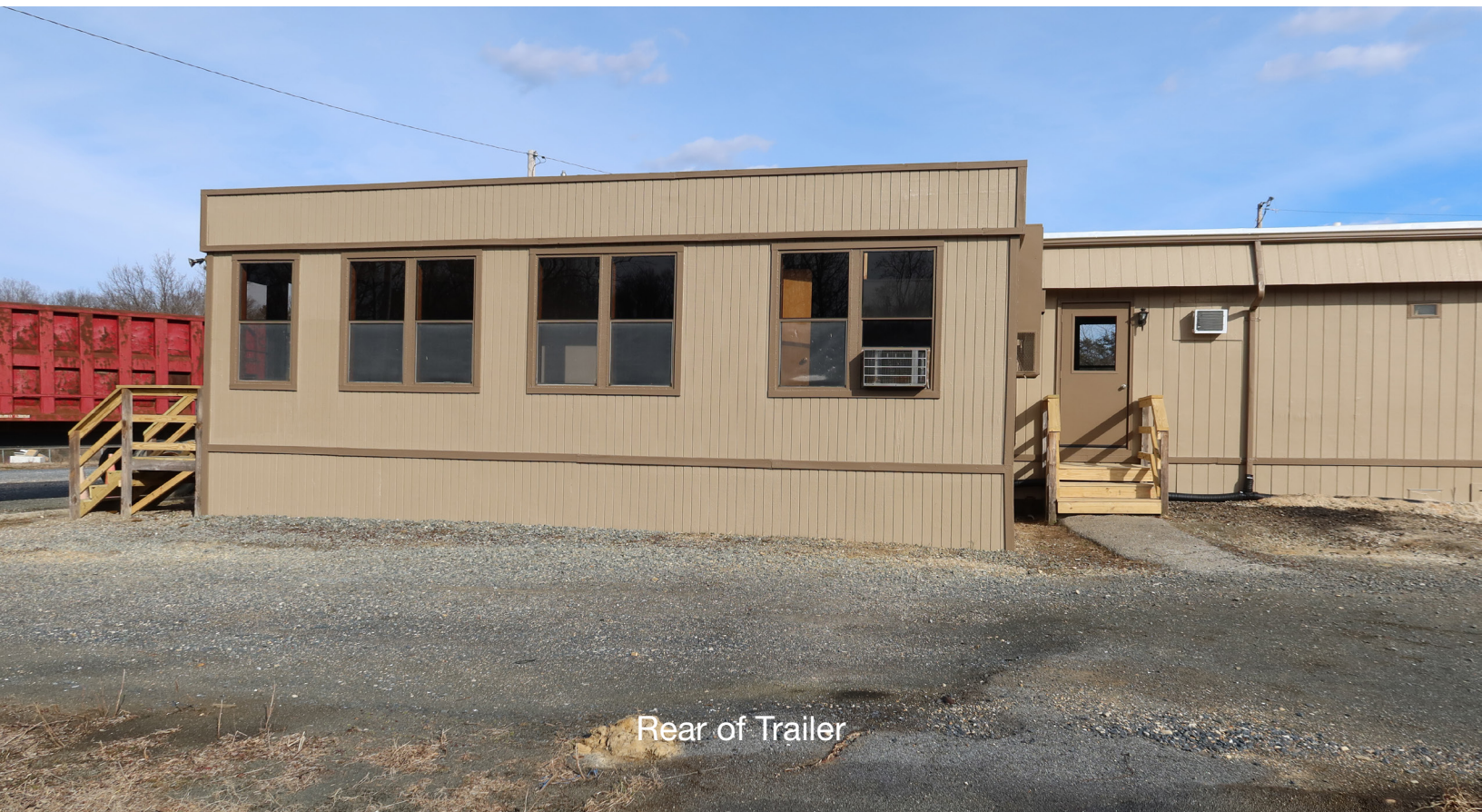
Rear of Trailer