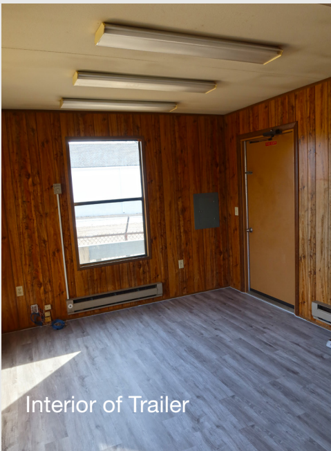
Interior of Trailer