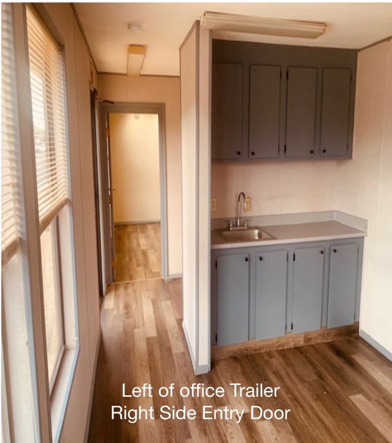
Left of office Trailer Right Side Entry Door