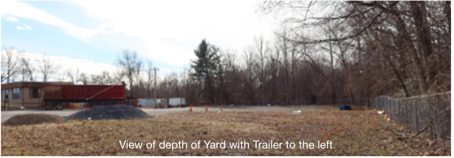
View of depth of Yard with Trailer to the left