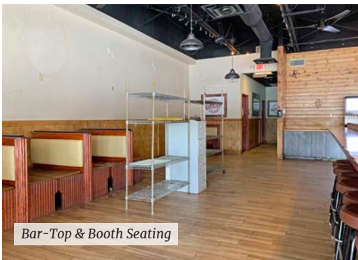
Bar-Top & Booth Seating