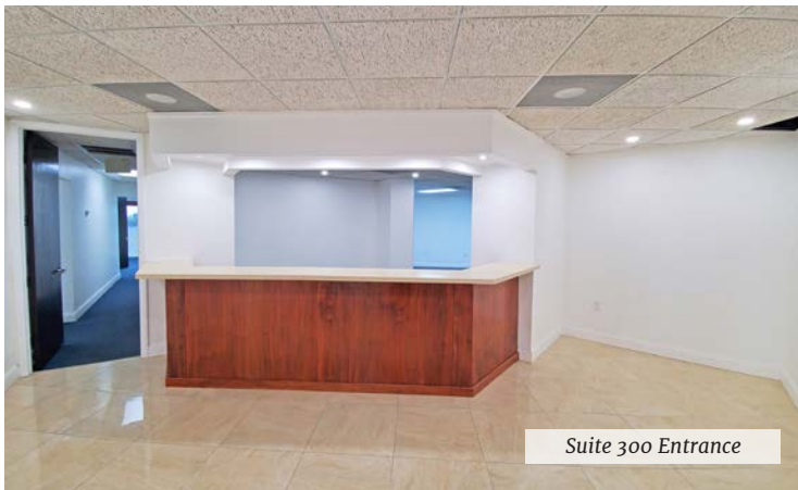
Suite 300 Entrance