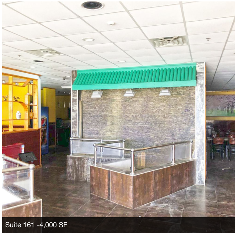
Suite 161 - 4,000 SF

NO WARRANTY OR REPRESENTATION, EXPRESS OR IMPLIED, IS MADE AS TO THE ACCURACY OF THE INFORMATION CONTAINED HEREIN, AND THE SAME IS SUBMITTED SUBJECT TO ERRORS, OMISSIONS, CHANGE OF PRICE, RENTAL OR OTHER CONDITIONS, PRIOR SALE, LEASE OR FINANCING, OR WITHDRAWAL WITHOUT NOTICE, AND OF ANY SPECIAL LISTING CONDITIONS IMPOSED BY OUR PRINCIPALS NO WARRANTIES OR REPRESENTATIONS ARE MADE AS TO THE CONDITION OF THE PROPERTY OR ANY HAZARDS CONTAINED THEREIN ARE ANY TO BE IMPLIED.