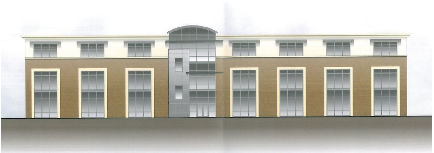
COMMERCE DRIVE DAUPHIN, LP OPTION 3 - 64,000 SF - 4 STORY OFFICE BUILDING HARRISBURG PENNSYLVANIA