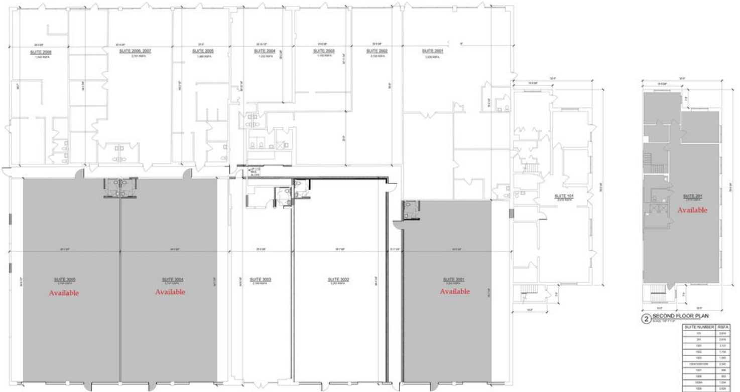
1 PROPOSED FLOOR PLAN SCALE: 1/8" = 1'-0"